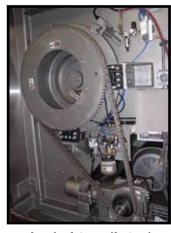
Mechanical Overtilt Options